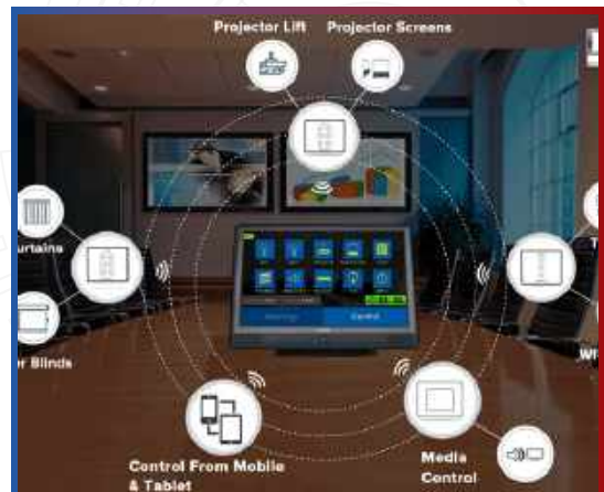
Office Automation, Board Room Solutions