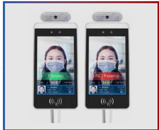
Facial Recognition / Card Based Access