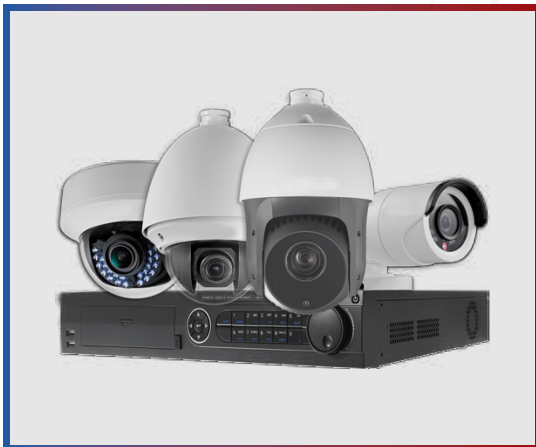
CCTV Surveillance Systems