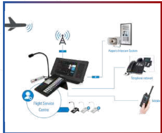
IP Based Plant & Building Communication Systems