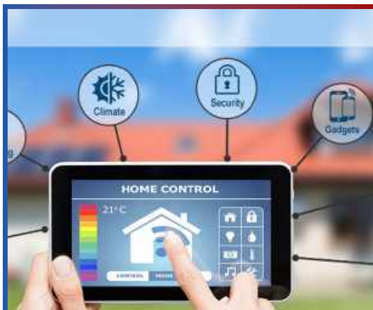
Home Automation Projector & Home Theatre