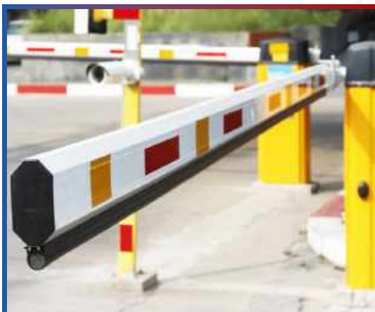
Boom Barrier, Gate Automations, Bollards etc.