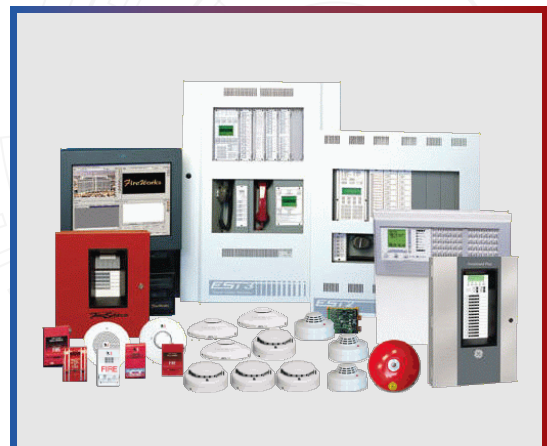
Fire Detection / Sprinkler / Extinguisher